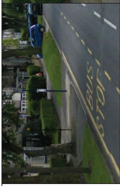
Example of Bus Stop Clearway