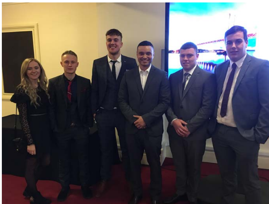
Picture of the six apprentices collecting their awards in December