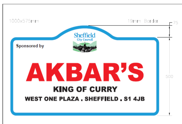
Example Roundabout Sign

There are 224 Roundabout and Boundary/Gateway signs in various locations throughout the City. These signs are located on roundabouts and attached to the City Boundary signs. The design of the signs is intended to provide company information that can be easily seen by highway users, incorporating the company's name, telephone number or website address.