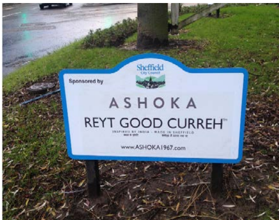
Example Roundabout Sign in situ