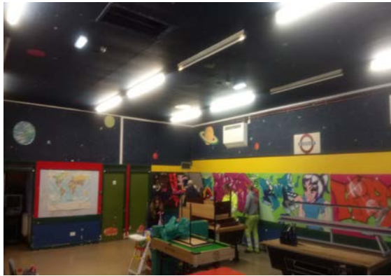
Heeley Farm community hall, before photo