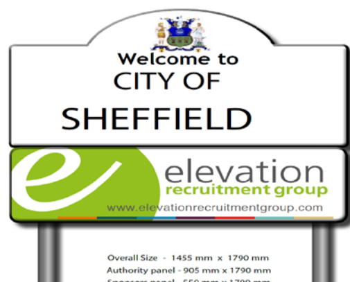
Example Boundary Sign