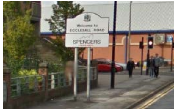
Example Boundary Sign in situ