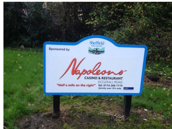
Example Roundabout Sign in situ

Activity on sponsorship can also be followed via our Twitter and LinkedIn accounts: