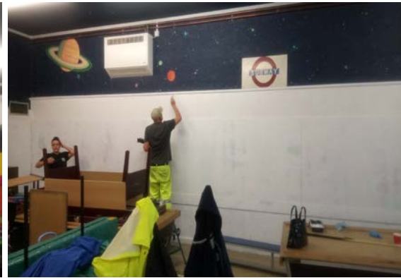
Heeley Farm community hall, during the charity work by Amey employees