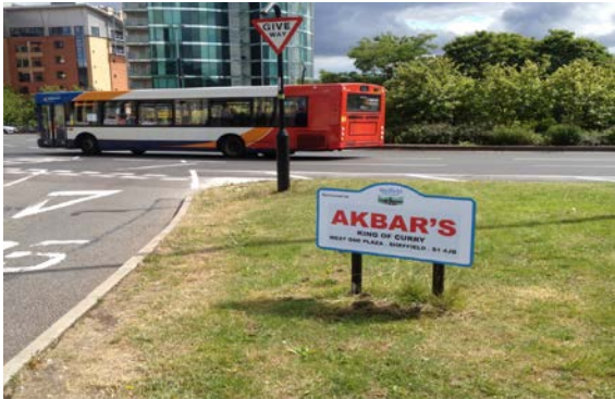
Example Roundabout Sign in situ