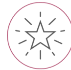
Committed to excellence

Confident and outward looking – sharing success, learning from others and being a strong partner in the City Region and across the north