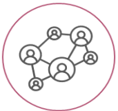
Connected to our communities and citizens

Collaborative – working with all partners and citizens; providing leadership and support where it’s needed and getting out of the way where we need to. Within SCC we will strive to work as ‘One Council’ with common purpose