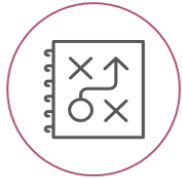
Clear direction & collective leadership

To be confident that Sheffield City Council can deliver this ambitious one year recovery plan, we need to reflect on our strengths and areas for development as an organisation; as well as be willing to invest in the corporate health and capacity of the council. As an employer and leader in the city, we need to aspire to be an outstanding organisation; a council that all Elected Members, staff and citizens can be proud of.