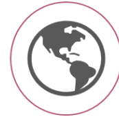
Confident and outward looking

Connected to our communities and citizens – a Council in and of our communities – working in the open, with and alongside people - a visible, accessible organisation