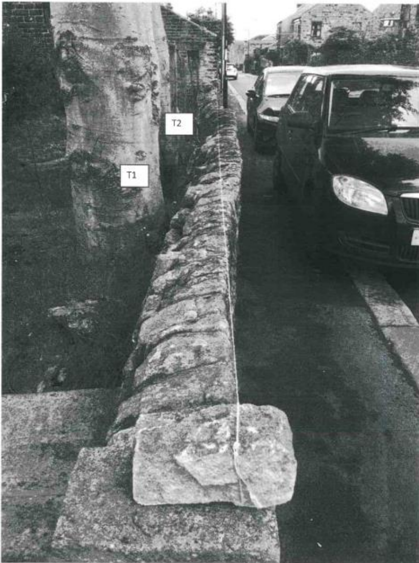
Figure 1 Wall position looking south along Middle Lane