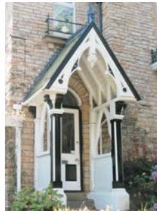
(n) Decorative timber porches, common in high Victorian Tudor Gothic architecture