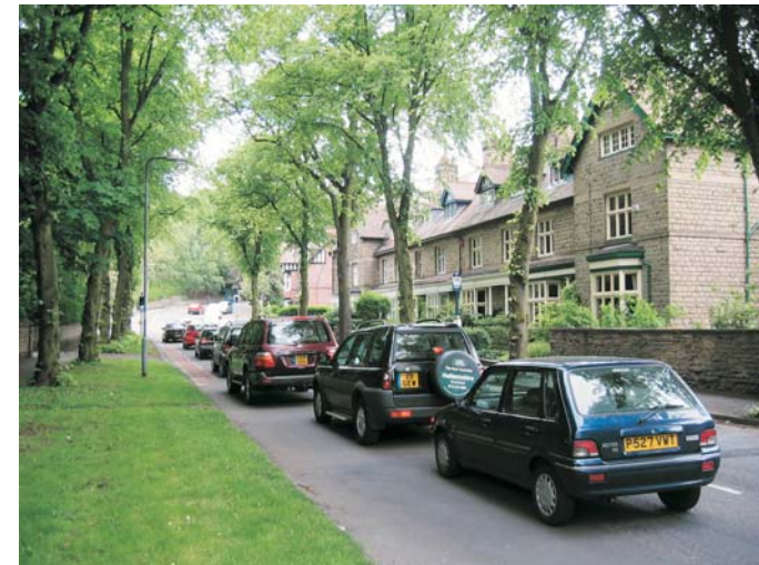
Fig.7 Psalter Lane is an important route through the area, especially at rush hour.

5.1 The escarpment of Brincliffe Edge/Psalter Lane marks a clear and distinctive boundary to the area. Psalter Lane, as the main route through the area and because of its straightness (which affords a vista along its length), reinforces the legibility