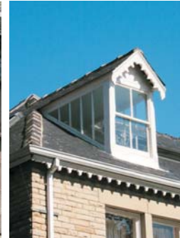
(k) Dormers are characteristic of some Victorian properties. Note the glazed cheeks.