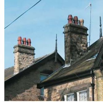
(e) Chimneys with pots.