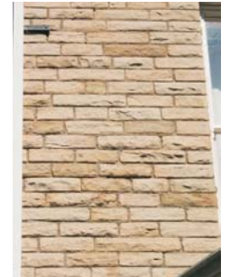
(r) Coursed stone typical to main elevations often in diminishing courses.