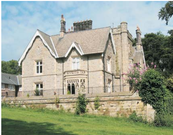
Fig. 12 Brincliffe Towers is a fine crenallated villa which was once the hub of local Victorian society. Its former grounds now comprise Chelsea Park.

7.5 Many villas remain in good original condition, with the retention of typical joinery features and decoration. Elaborately carved barge boards, doors, windows, frames and mouldings are of painted timber construction, with the common use of two and four pane vertical sliding sash windows (with horns) on earlier houses. Some later Edwardian houses, such as the semi-detached houses on Psalter Lane have original casement windows, occasionally incorporating leaded lights and curved glass. Cast iron is also decoratively employed in railing, gateways and other detailing. The quality of local craftsmanship in building construction and techniques is high.