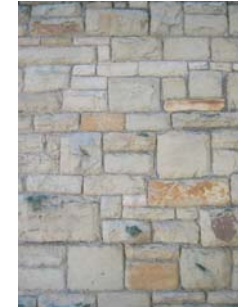
(q) Uncoursed squared rubble - common to side elevations and some inter war houses.