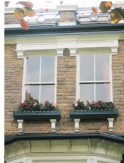
(i) Sliding sash windows constructed in timber.