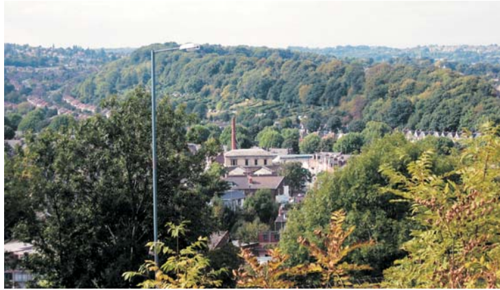
Fig.8 Brincliffe Edge from Chesterfield Road - the wooded escarpment edge is a significant topographical feature in the landscape, important for the legibility of Nether Edge and the wider area.

visually distinctive and arresting architectural character, with minor landmark features such as towers, gables and double height bays. Orientation is particularly difficult in Kenwood, because of the similar appearance of its Victorian streets and the informality of the street layout. This is exacerbated by the prevalence of junctions of five or more streets, a distinctive feature of the area. However, the more regular street pattern in the vicinity of Brincliffe and Nether Edge is more readily perceived.