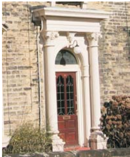
(m) Entrances in elaborately carved wood or stone in classical style.