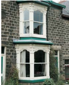
(h) Bay windows, both single and double height.