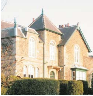
(a) Varied roofing and architectural forms.