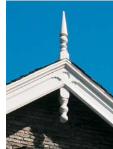
(p) Finials to the apex of roofs.