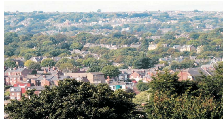
Fig.9 View of Nether Edge from Meersbrook Park - the sloping topography and abundance of trees is the main feature of the area's landscape setting. Note that no building breaks the tree canopy.

5.4 The “rat running” of vehicles through residential areas of Nether Edge, particularly on Nether Edge Road, is a particular problem during peak times of the day. This problem is of localised importance which diminishes the character, appearance and amenity of the area.