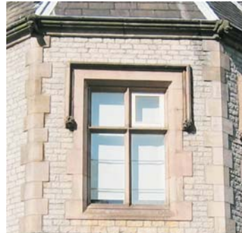
(j) Carved stone, including window/door surrounds, mullion, quoins and hood moulds.