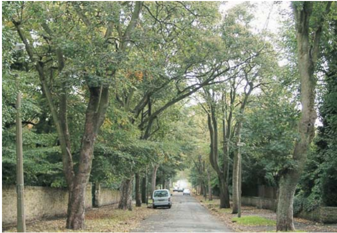
Fig.13 Lyndhurst Road - one of the finest tree lined streets in Brincliffe laid out in 1868. The trees which frame the vista down the road, were laid out prior to houses being built to create a leafy environment.

8.1 Chelsea Park is the most significant area of greenspace. Formerly part of the grounds of the Brincliffe Towers this attractively sloping area of parkland, with its mature trees, is well used by local people. The parkland itself is largely invisible from the outside, being obscured either by high walls or trees, although the latter do contribute significantly to the visual quality of adjoining areas. Public art within the park is an additional attraction.