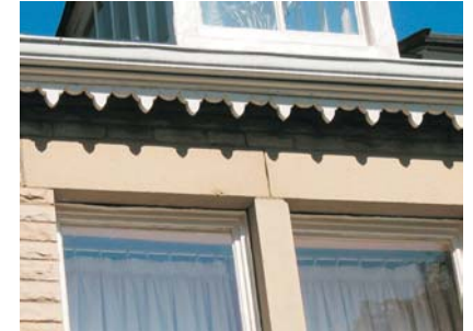
(l) Stone sills and lintels.