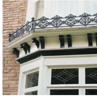
(o) Ironwork as decoration.