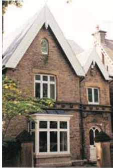
(g) Vertical emphasis & heirarchy of window sizes and forms.