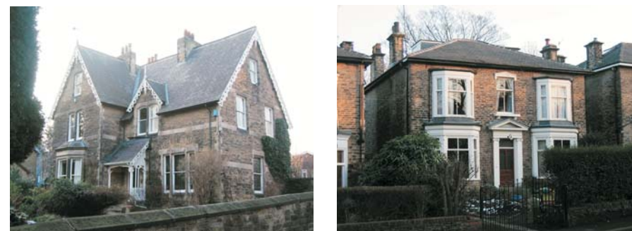
Fig.10 The complex asymmetrical gabled form of the gothic style villa (left) strongly contrasts with the more symmetrical and restrained classical (or Georgian) influenced villas (right).

7.1 Villa development tended to adopt the 19th Century Gothic Revival style popular in this period, although the more restrained Georgian influence is also seen in a number of earlier properties (Fig.10). The gothic style is boldly expressive and richly detailed, with a solid appearance, often asymmetrical in form and commonly with a highly ordered arrangement of gables, dormers, bay window and towers balanced by regular openings or other rhythmic features. The villas possess impressive verticality, modelling and three-dimensional quality, with steep roof pitches, dormers and varied roof forms providing attractive skylines. The more classical, Georgian influence to some houses leads to a more restrained building form, with shallower hipped roofs, simpler and more symmetrical elevations and roof forms, commonly with tall chimneys on either gable.