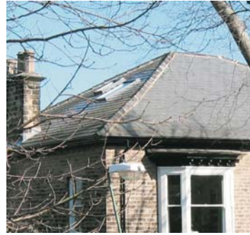
(d) Hipped roofs.