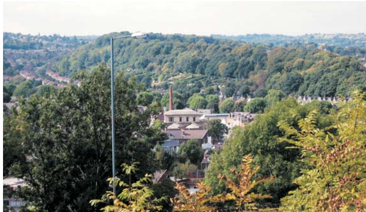
Fig.8 Brincliffe Edge from Chesterfield Road - the wooded escarpment edge is a significant topographical feature in the landscape, important for the legibility of Nether Edge and the wider area.

visually distinctive and arresting architectural character, with minor landmark features such as towers, gables and double height bays. Orientation is particularly difficult in Kenwood, because of the similar appearance of its Victorian streets and the informality of the street layout. This is exacerbated by the prevalence of junctions of five or more streets, a distinctive feature of the area. However, the more regular street pattern in the vicinity of Brincliffe and Nether Edge is more readily perceived.