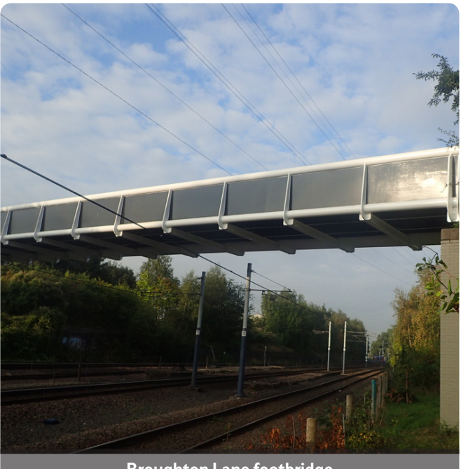
Broughton Lane footbridge