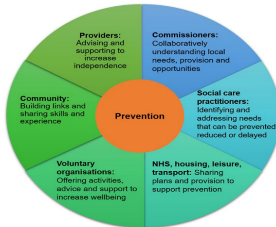
Figure 1: Prevention in a joined-up local system

1.7 This good practice guidance underpins the adult care operating model implementation and our Adults Early Intervention and Prevention Delivery Plan. The Delivery Plan references the activities underway identified in September 2023 Committee in the Strategy update and in particular focus on our approach to building and working with communities, voluntary sector, leisure, and technology enabled care.